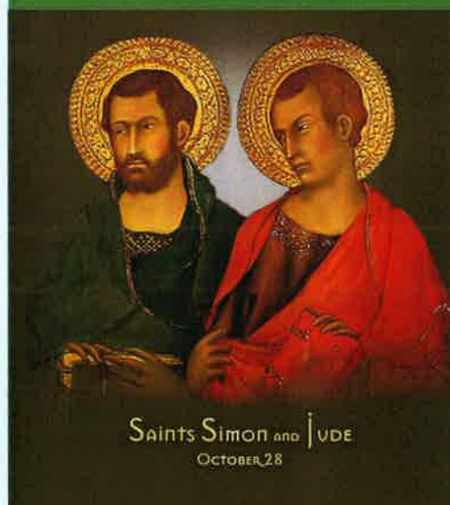
SAINTS SIMON AND JUDE OCTOBER 28